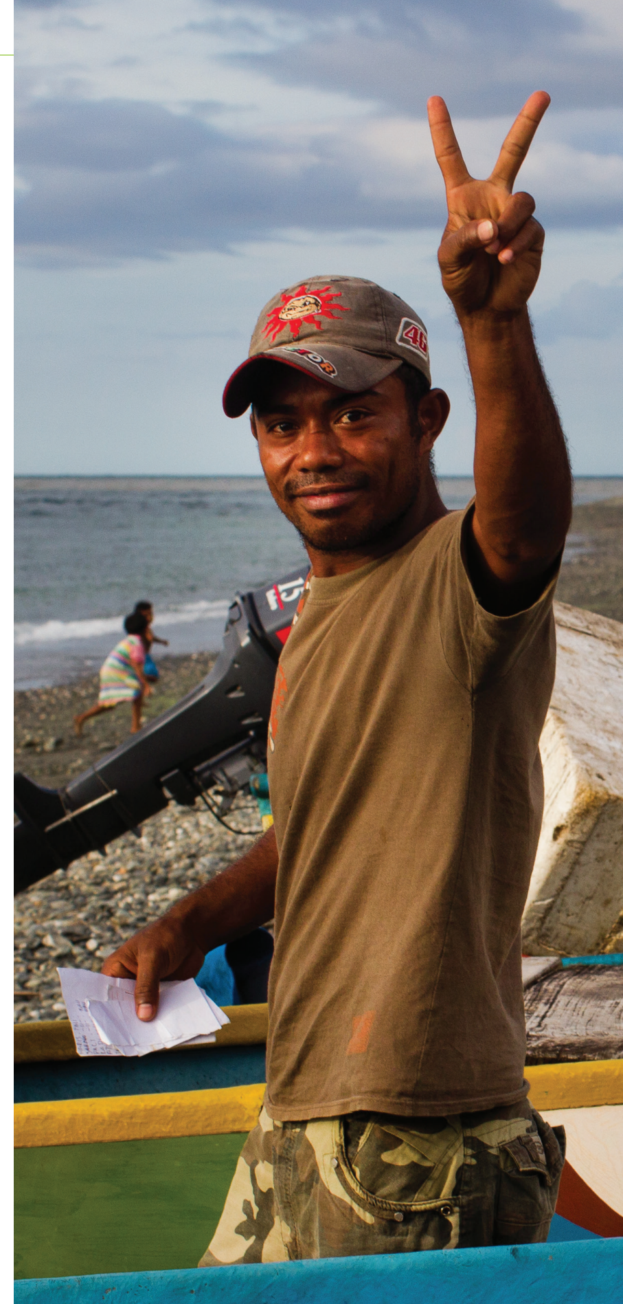
A fisherman at the Maluku handline yellowfin tuna fishery, Waepure Village, Buru Island, Maluku, Indonesia.

The advantages of a strong safety and health culture are not restricted to workers. Management and the business enterprise overall can benefit from the reduced costs, improved morale, and enhanced production resulting from a safer workplace. With less days lost to injury and illness, improved relations with an engaged labor force, and a spirit of openness and collaboration, an enterprise can reach new heights of success, benefiting stakeholders and society on the whole. When a company's safety standards are verified through a credible program like Fair Trade Certified, brands, retailers, and traders can source their products with confidence, helping improve traceability and credibility for their business, and creating shared value for consumers who care about shopping ethically. The end game is to generate a true win-win scenario for everyone involved.