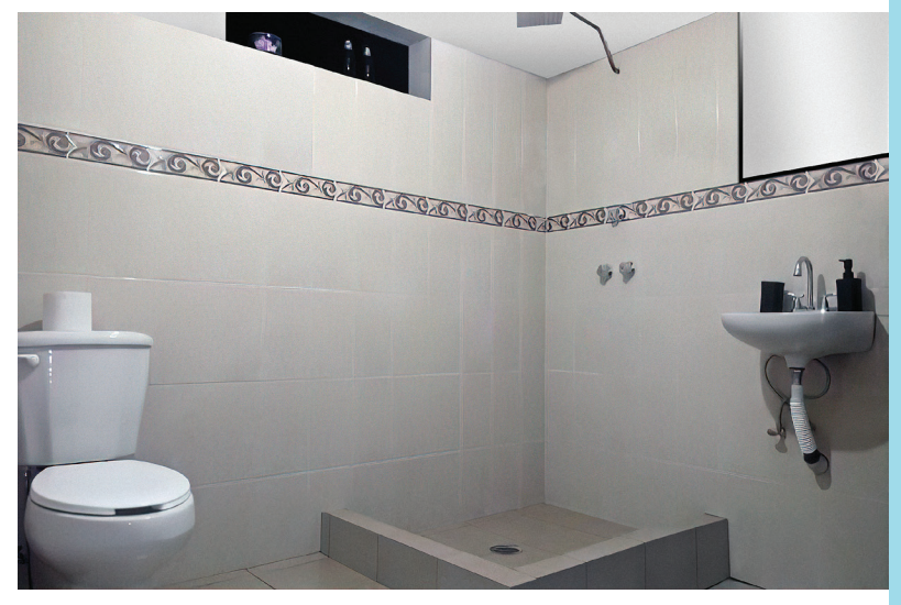
A bathroom renovation design for employee homes in Guanajuato, Mexico.

The renovations include new sinks and showers and replacing flimsy materials such as wood and cardboard. The unhygienic bathrooms will continue to be addressed to help prevent illnesses contributing to absences from work and medical expenses. These improvements not only make sanitary conditions accessible for the workers and their families, but also enhance their sense of health and well-being.